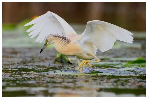
Squacco Heron is common and delightful photo-subject...