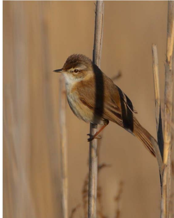
Collared Pratincole and Paddyfield Warbler near Constanta...

Price: All inclusive except the international flight, the guide tip and the personnel expenses such as alcoholic drinks, laundry and phone calls.