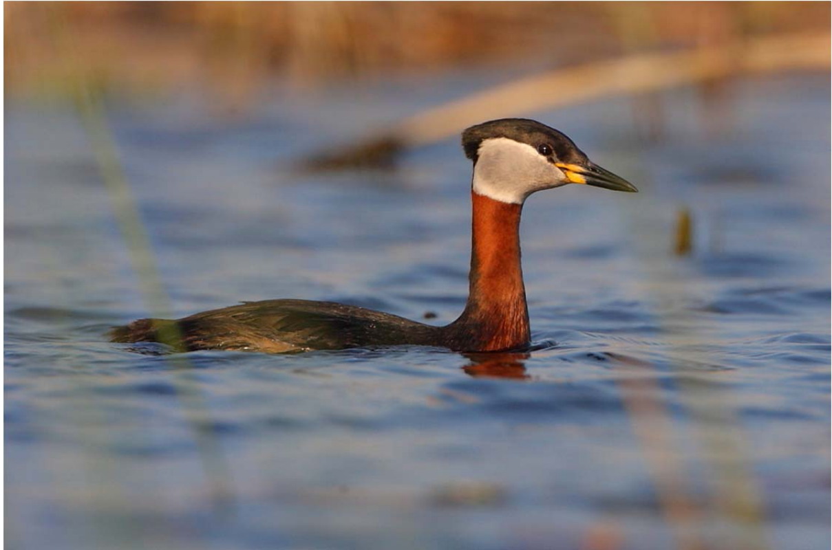
Red-necked Grebe is fairly common in the Danube-Delta

Day 4 After a last morning session we will sadly leave the Danube-Delta behind and travel back to Tulcea for an overnight.