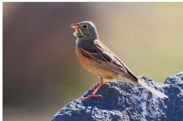
Levant Sparrowhawk and Ortolan Buntings are fairly common in the Macin Mountain NP