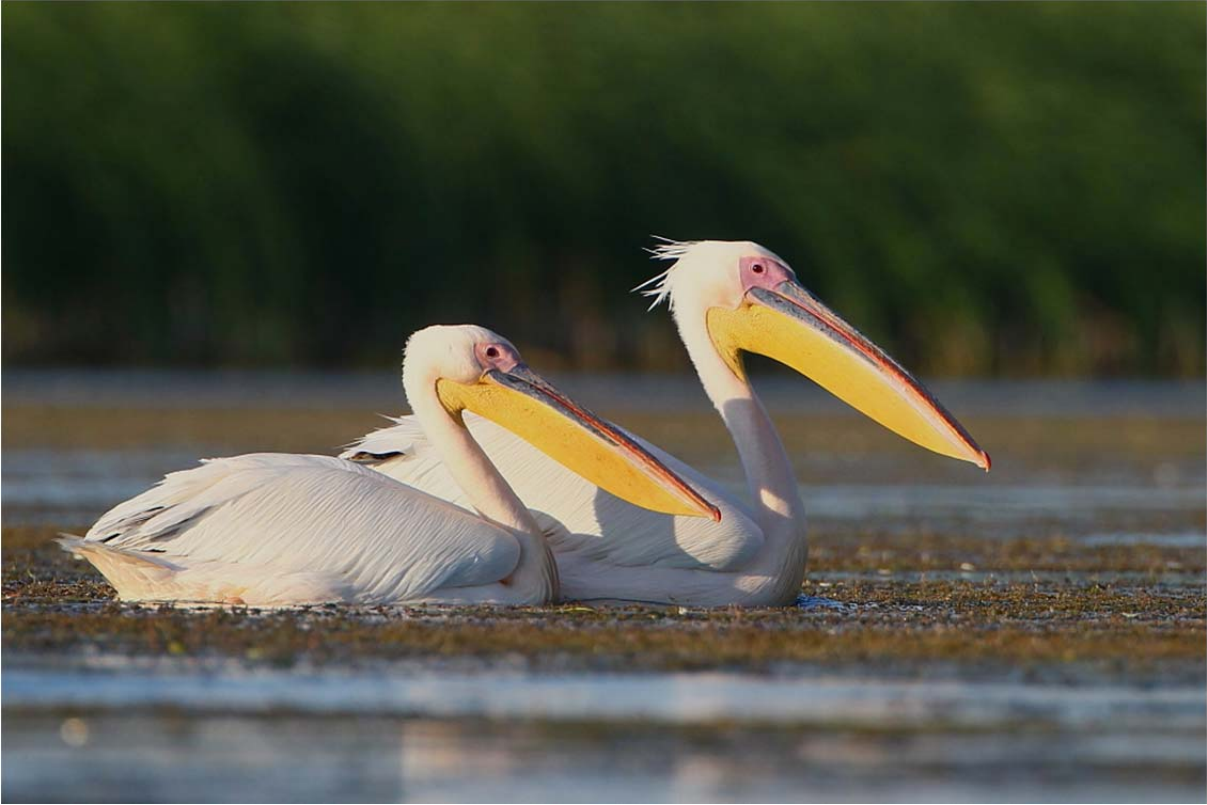
White Pelicans and Whiskered Tern