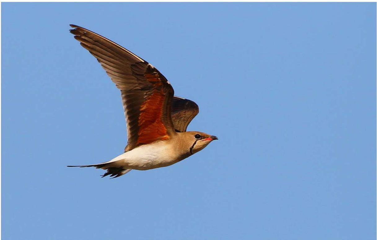
We will photograph Collared Pratincoles around Constanta plus other steppe species like Isabelline and Pied Wheatears ...

Days 7 A full day will be spent around Constanta where we will concentrate our efforts on Steppe species. We will be doing mainly stalking photography but blinds can be used if required.