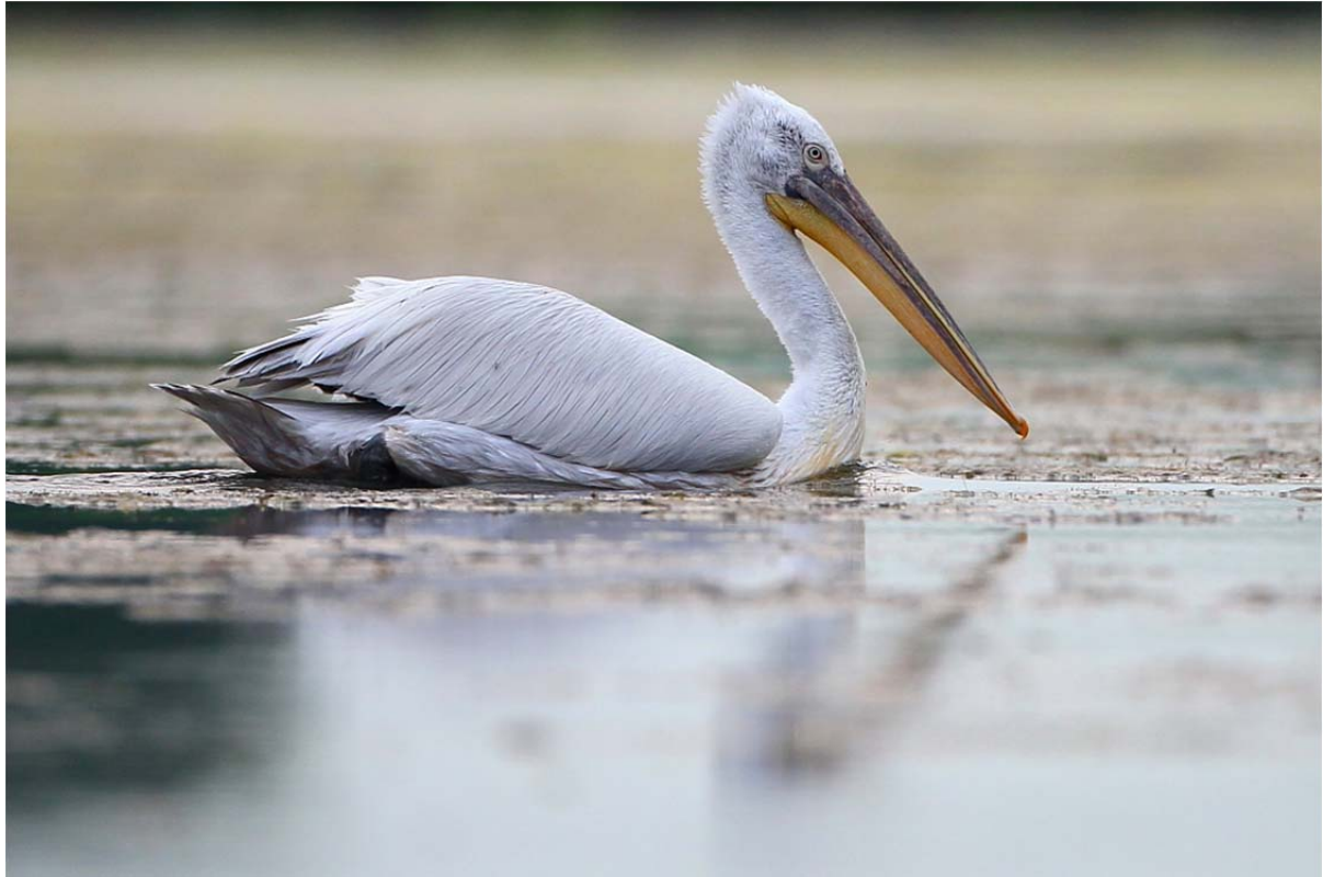
Dalmatian Pelican is one of the highlights of the Danube-Delta