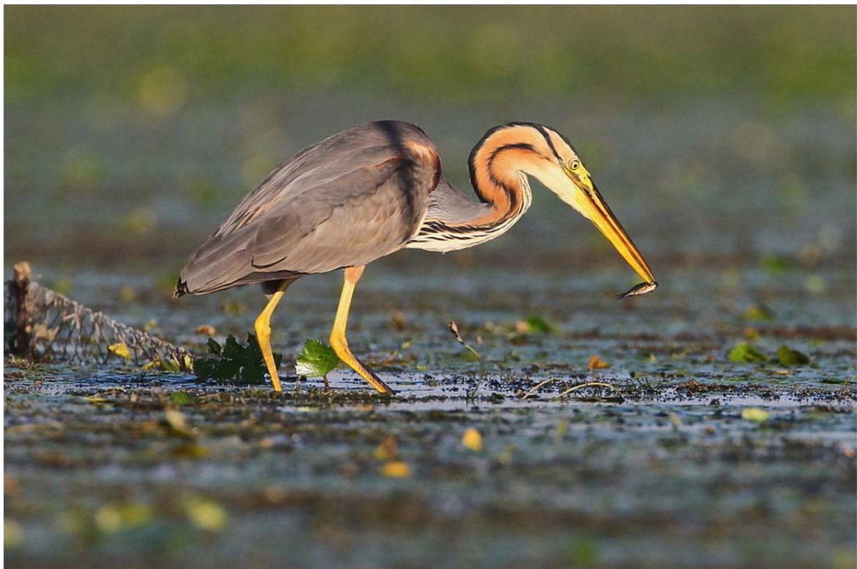
Purple Heron catching a small fish