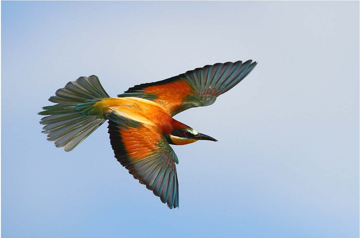
Bee-eater is a common breeding bird and we will have various opportunities to photograph them...

Days 7 A full day will be spent around Constanta where we will concentrate our efforts on Steppe species. We will be doing mainly stalking photography but blinds can be used if required.